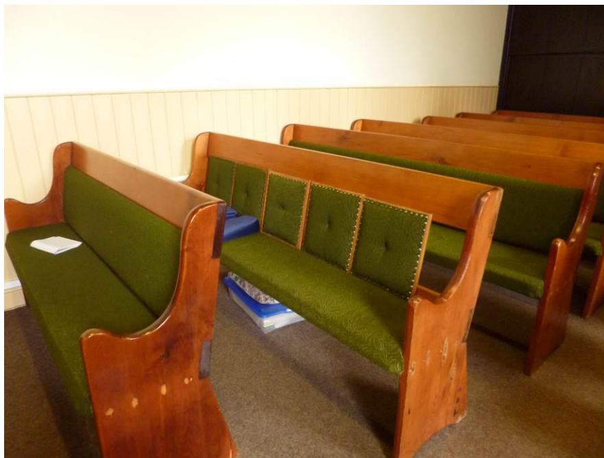
Fig.2: benches in the meeting room

The meeting house has late nineteenth pine benches arranged for use by the evangelical congregation, facing the stand.